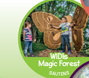
WIDIs Magic Forest SAUTENS