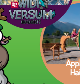
Apple Mile Haiming