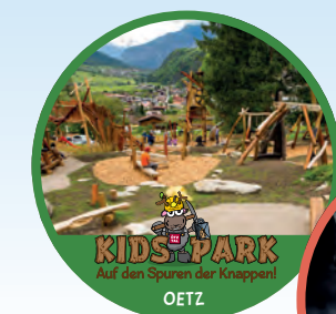
KIDS PARK Auf den Spuren der Knappheit OETZ