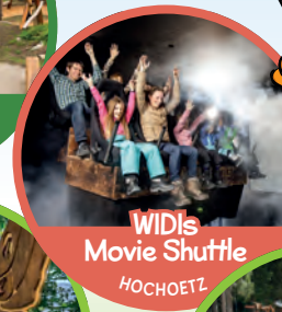
WIDIs Movie Shuttle HOCHOETZ