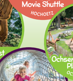
Ochsen Garten Forest Playground OCHSENGARTEN